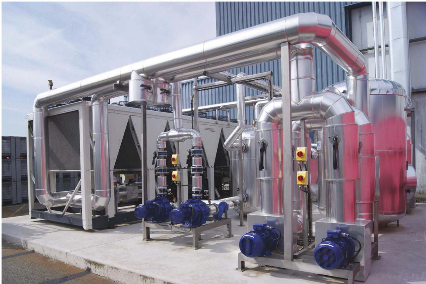
And outdoor chiller also was installed at the Blédina facility.

are driving the global warming debate. In industrial refrigeration installations, there is no need to account for the amount of CO 2 used, and it does not need to be reclaimed.