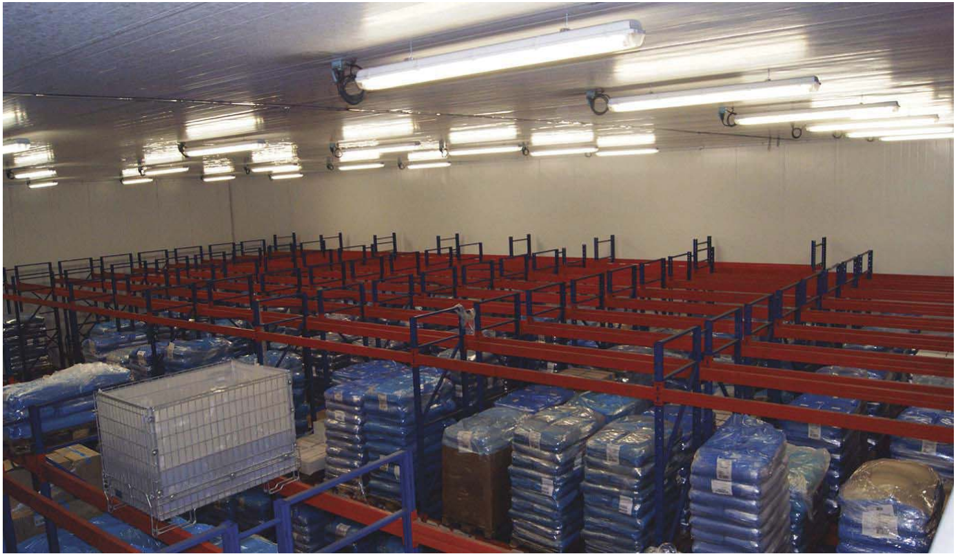
For Blédina's subzero cold storage room, a cooling unit using CO 2 with a power capacity of 127kW at -0.4°F (-18°C) was selected.

most environmentally friendly and energy efficient fluids," explains Tomaz. "The safety data sheet does not have any hazard warnings or symbols on the label."