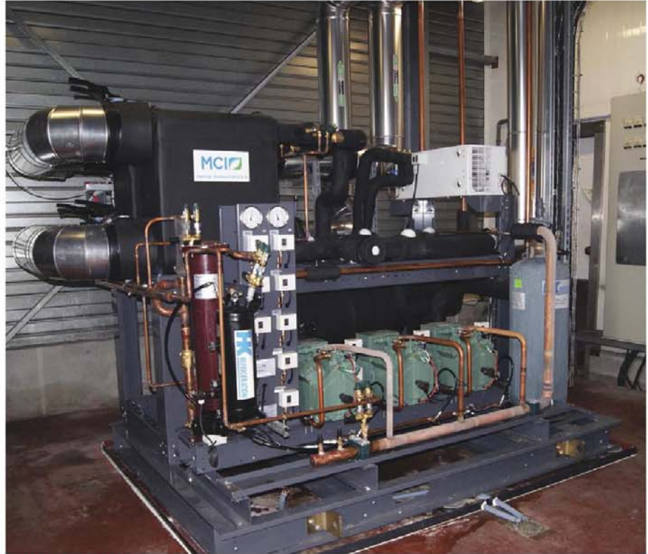
The Blédina facility also incorporates a central CO 2 unit.

Instead, what Blédina opted for was a multipart solution. For the subzero cold storage room, a cooling unit using CO 2 with a power capacity of 127 kW at -0.4°F (-18°C) was selected. CO 2 is called a natural refrigerant because it exists in the environment naturally. A release into the atmosphere from the refrigeration systems would have a negligible effect, particularly compared to other CO 2 sources that